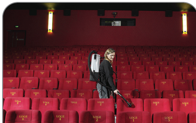
Comfortable general maintenance