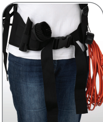
Accessories are stored on belt for easy reach