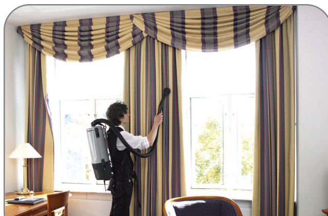
Convenient cleaning in hospitality sector