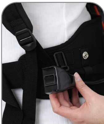
On/Off switch is conveniently located on the belt for easy reach