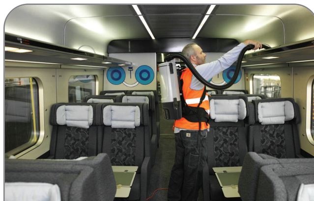
Hard-to-reach areas in the transportation industry