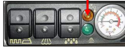
Low Water Light