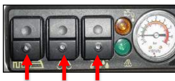
Hot Water Injection