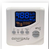
GFX5 (GFI #7172) Automatic Humidistat (Included)