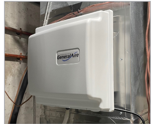
Vertical Supply Plenum Installation