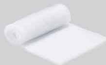
PREFILTER 12 MONTHS