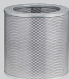
CARBON FILTER 2 YEARS