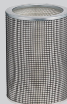
HEPA FILTER 3-5 YEARS